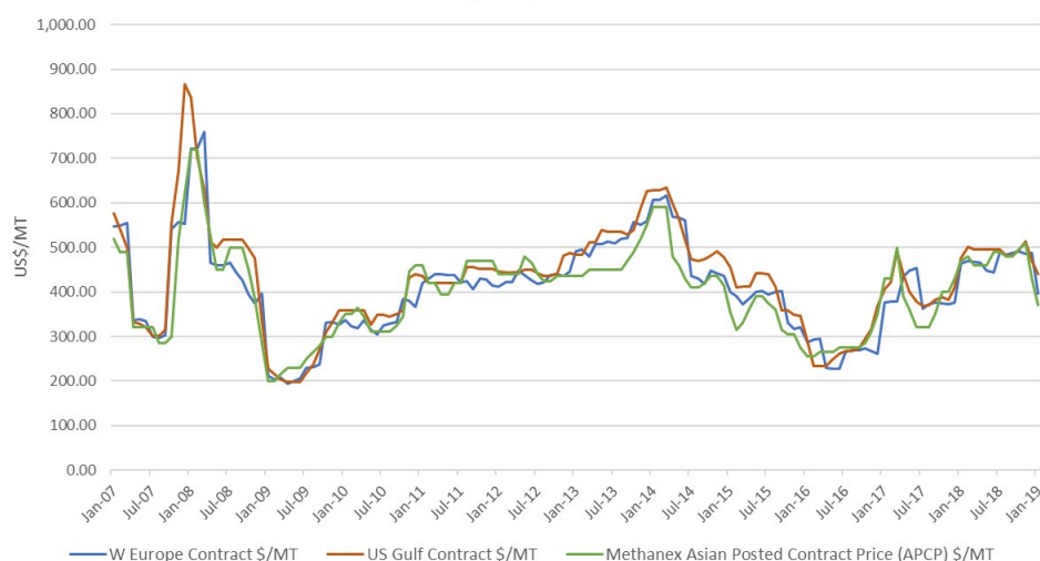
IHS US GULF AND WESTERN EUROPE METHANOL CONTRACT PRICES AND METHANEX ASIAN POSTED CONTRACT PRICE (APCP) JANUARY 2007 - JANUARY 2019

We are not able to predict future methanol supply and demand balances, market conditions, global economic activity, methanol prices or energy prices, all of which are affected by numerous factors beyond our control. Since methanol is the only product we produce and market, the price of methanol has a significant effect on our results of operations and financial condition.